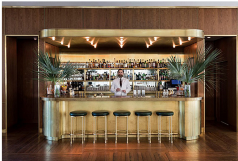
Living Room at The Dewberry Charleston