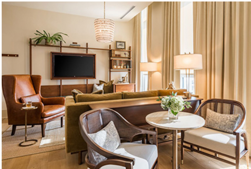
Charleston Flat at The Dewberry Charleston

Speaking more broadly, The Dewberry is truly a unique—and uniquely personal—experience for me. At one point in the design process, my father and I were both battling forms of cancer; before he passed away in 2011, I told him I was going to name the hotel after him. Nothing is more special than that.