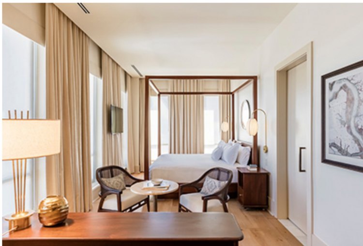
Charleston Flat at The Dewberry Charleston

The Charleston Flat is my favorite room at The Dewberry. It feels like a sanctuary and is handsomely designed with touches of leather, travertine and marble. Depending on which room you are in, you get an amazing view of Marion Square or the steeple of the over 200-year-old Second Presbyterian Church next door. We are Charleston's ultimate vantage point.